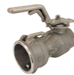
MD20D (need for stainless steel product containers)